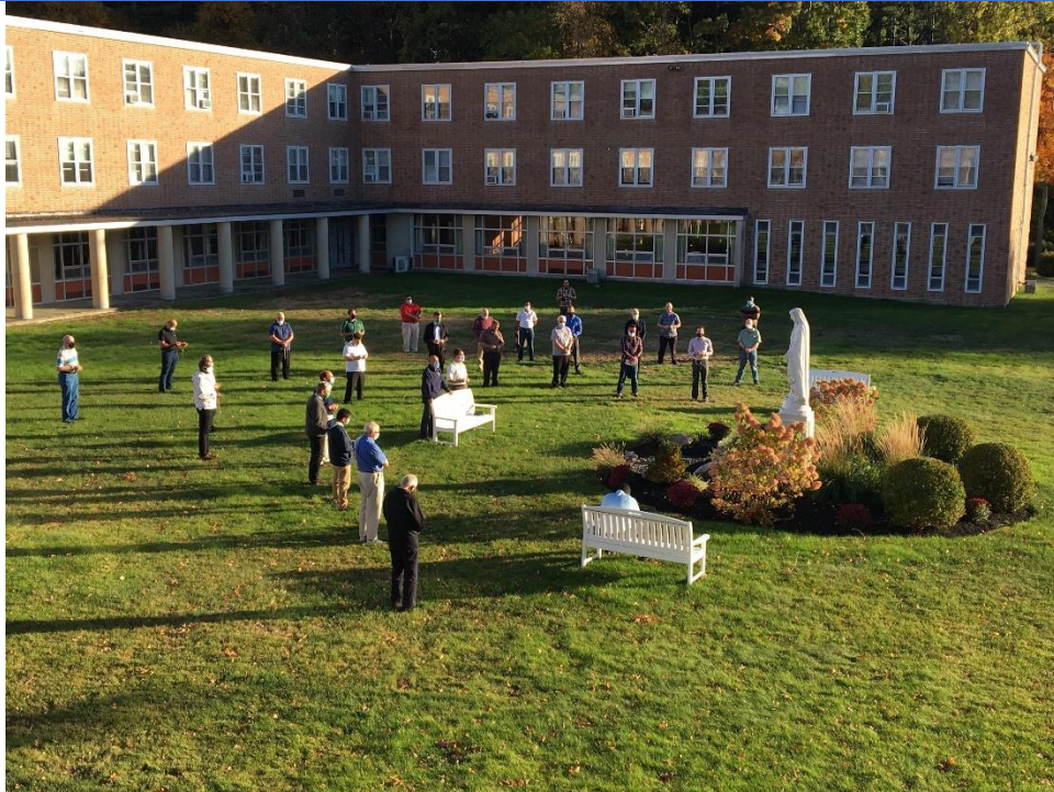
Praying the Rosary, Mary Courtyard

The seminary is in Weston, Massachusetts, 13 miles west of downtown Boston, on over 35 acres of wooded land. Our proximity to Boston makes available to us numerous educational, cultural and recreational opportunities.