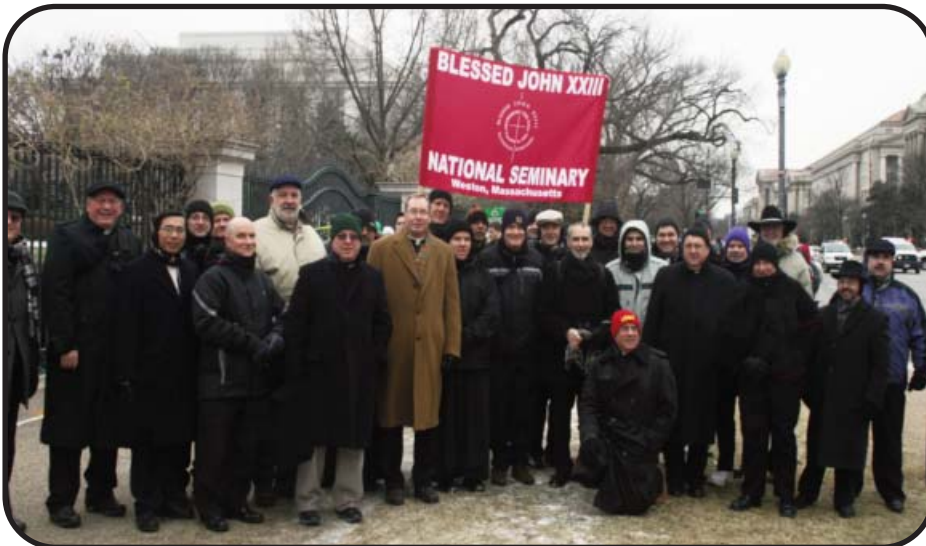
Over 40 seminarians, faculty members and alumni participated in activities during the annual March for Life in Washington, D.C.

The next morning, on Friday, January 26th, many of our seminarians attended the Youth Mass at the Verizon Center before meeting up with several more Seminary alumni from the Washington area. The entire group then attended the Rally on the Mall and March for Life, which culminated in front of the United States Supreme Court.