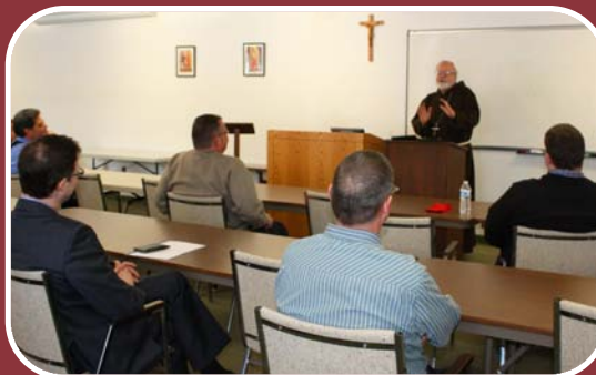
Cardinal Seán O'Malley OFM Cap addressing event attendees

Mass was celebrated at the Seminary by Cardinal Seán O'Malley OFM Cap.