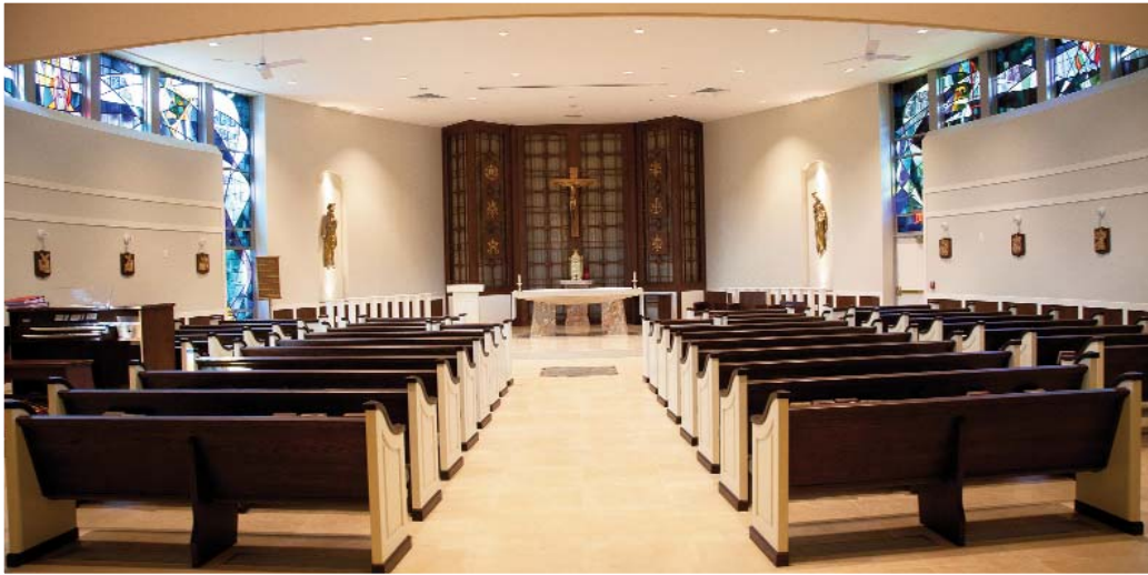
The newly-renovated "Alumni Chapel" - the heart of our community

rously contributed to the rebuilding of the new Chapel.