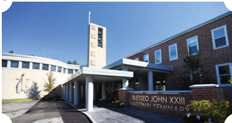
The newly-renovated Seminary entrance, with improved signage and access

Perhaps the most comprehensive modification goes unseen: the installation throughout the building of a fire-protection system with new alarms and a sprinkler system. These projects represent the completion of the first phase of our capital campaign.